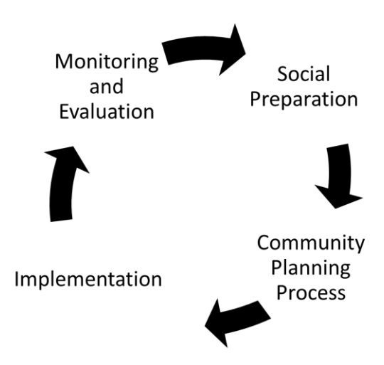
Diagram 2-2: Community Development Process

Community Development Process (CDP) in O&OD is described as a continuous process for communities to organise themselves and realise CIs and community empowerment for bringing positive changes in their life. In CDP, there are indispensable four (4) steps, namely Social Preparation (SP), Community Planning Process (CPP), Implementation and Monitoring and Evaluation (M&E).